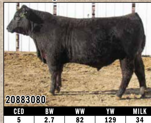
Lot 88 Gray's Columbus 2673