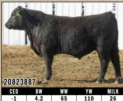
Lot 86 Gray's Chisum 2563