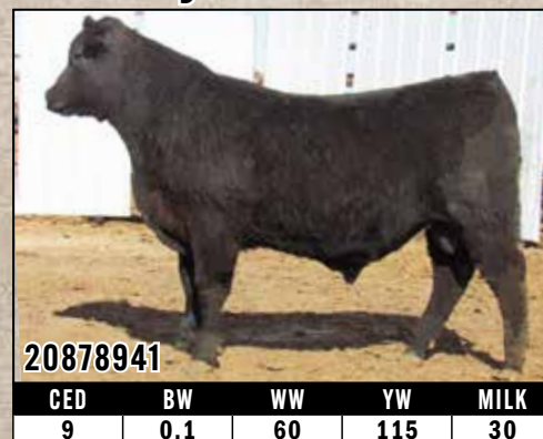
Lot 141 Gray's Winchester 6483