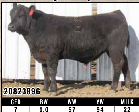
Lot 98 Gray's Cooper 3223