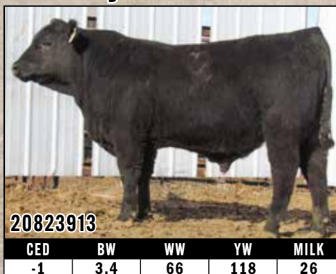
Lot 119 Gray's White River 4193