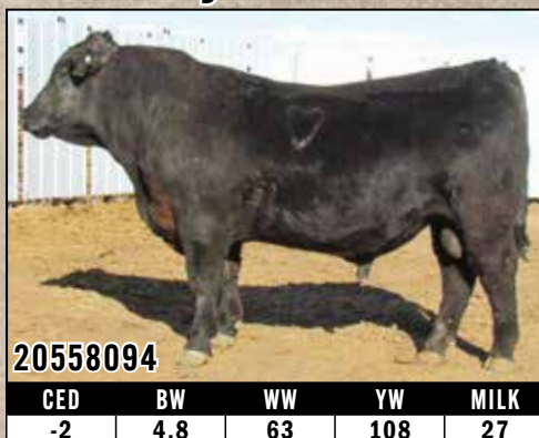
Lot 14 Gray's Chisum 4342