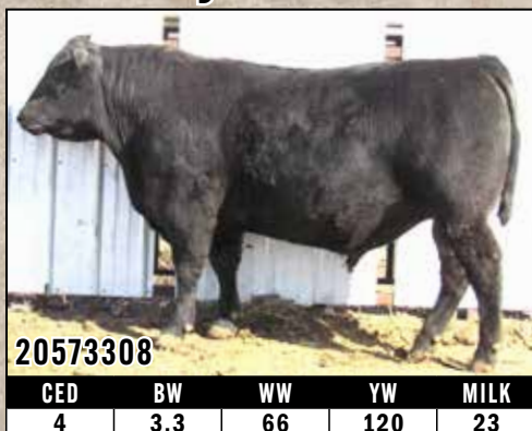
Lot 1 Gray's Yankton 782