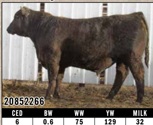
Lot 59 Gray's Resilient ET 743